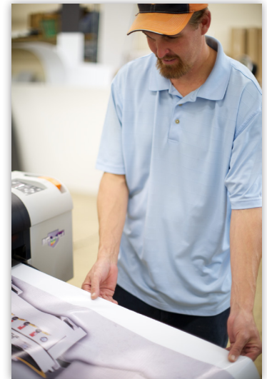
Rest assured with free phone support